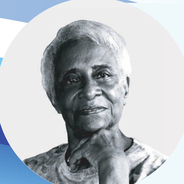
THE HONOURABLE Sybil lone McLaughlin MBE, JP 24 AUGUST 1928 – PRESENT

National Hero, The Honourable Sybil lone McLaughlin continues to be a beloved and active member of society, and a role model for many Caymanians today. Mrs. McLaughlin received the country's highest honour in 1996 for her invaluable contributions to Cayman's parliamentary development, as well as to community life. Among her outstanding achievements, Mrs. McLaughlin was appointed the first Speaker of the Legislative Assembly in 1991. She is also the first female Clerk of the LA in the Commonwealth.