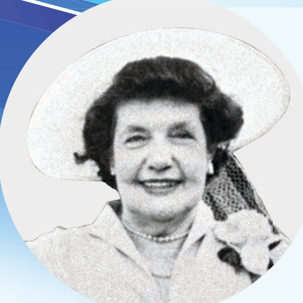
THE HONOURABLE Leila Elberta Ross-Shier Cert. Hon. 16 NOVEMBER 1886 – 26 SEPTEMBER 1968

The Honourable Leila Ross-Shier was a woman of infinite talent, a gifted librarian, prolific writer, composer, accomplished musician, imaginative poet, songstress, incomparable storyteller, community historian, and cultural icon. She was the foremost writer of Caymanian culture and identified with all things Caymanian, and is remembered for her gift of inspiring and improving literacy and readership amongst those she worked with. She is best immortalised in her lyrical and melodic composition of the National Song "Beloved Isle Cayman", written in 1932.